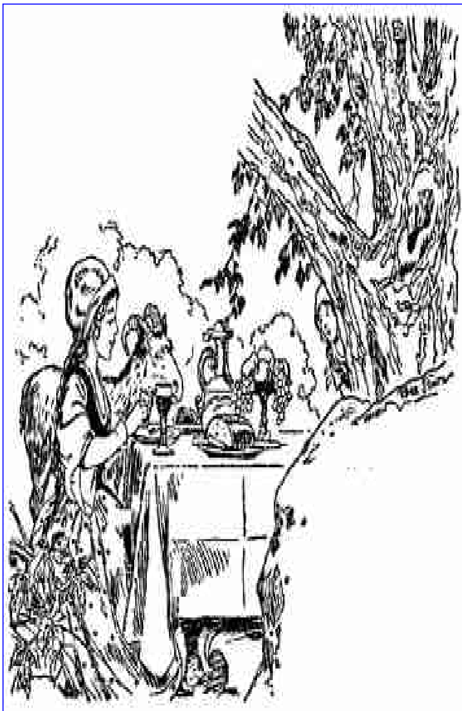
"Little kid, milk